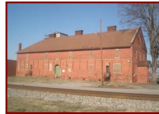
Former Piedmont Wagon, 1020 Main Avenue NW

Brownfields Redevelopment Newsletter March 2009