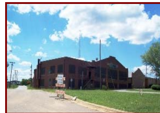
Former Moretz Mill, 74 8th Street SE

Presented by The City of Hickory & US Environmental Protection Agency