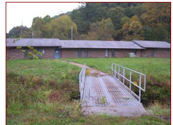
Former Davis Pipe Property – Blountville

Presented by Sullivan County First Tennessee Development District and US Environmental Protection Agency