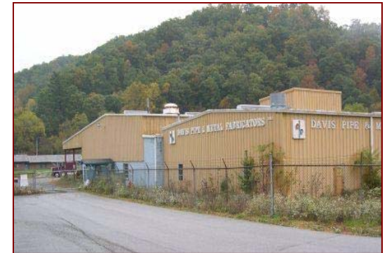
Former Davis Pipe Property – Blountville