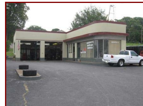
Johnson City Site 1