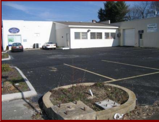
Johnson City Site 2

EPA awarded First Tennessee Development District (FTDD) a Community-Wide Brownfield Petroleum Assessment Grant totaling $200,000. The grant was awarded in September 2007 and has a term of three years. To date, assessment grant funds have been used to inventory and prioritize potential Brownfield properties; perform Phase I environmental site assessments (ESAs) on four candidate sites containing inactive petroleum underground storage tanks; and develop Phase II assessment work plans and associated cost estimates to evaluate the potential for petroleum or other hazardous constituents in soil and ground water at three candidate sites.