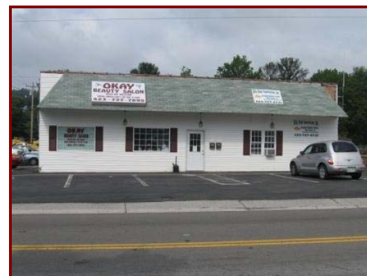
Mountain City Site

Presented by First Tennessee Development District and US Environmental Protection Agency