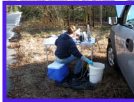
Ground water sampling at the SDS site.