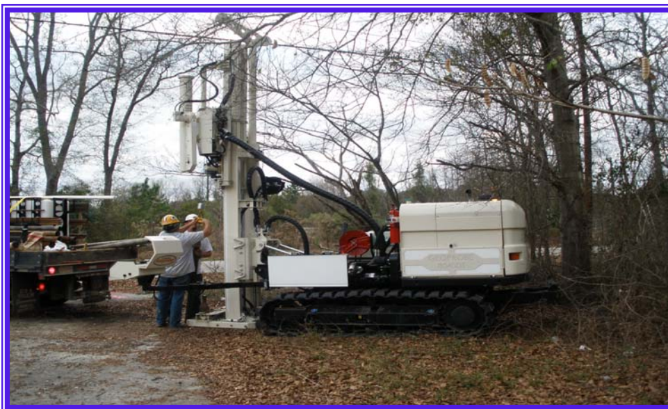
Soil Sampling Activities at the SDS site.

“ The Phase II site assessment report concluded that minor soil and ground water impacts exist at the former SDS properties.”