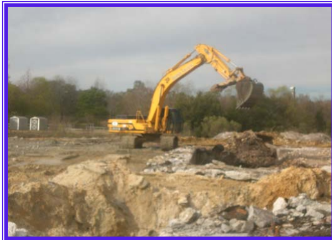
Demolition Activities at the Former SDS Incinerator Site

An environmental investigation was recently completed at the site (See Page 3). Now that the potential environmental risks are understood, planning for the reuse of the property can begin. A community outreach meeting scheduled for September 29, 2009 will give members of the Hampton community a chance to share their vision for the currently undeveloped property.