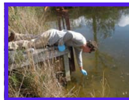
Surface water sampling from a detention pond at the SDS site.

“ The Phase II site assessment report concluded that minor soil and ground water impacts exist at the former SDS properties.”