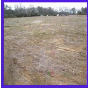
Current view of former SDS Incinerator Site.