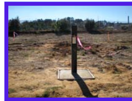
Completed monitoring well at the SDS site.

With these minor restrictions in mind, redevelopment planning can begin.